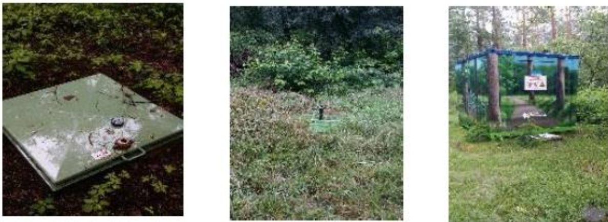
Figure 3. Implementation of the oxygen curtain technology.

The in-situ technology offers several advantages compared to alternatives: First, the natural subsurface bioreactor displays high performance stability, once the aeration phase has been established and stabilized in the aquifer. Second, the aquifer is very suitable as a reactor for nitrification processes due to constant temperature and sufficient pH-buffering mainly based on naturally present or artificially added carbonate compounds. Third, the reaction rates of nitrification for effective in-situ remediation were found to be adequate due to the slow flow velocity of the aquifer. Fourth, the infrastructure required to implement the in-situ treatment scheme was mostly limited to subsurface wells, so the land footprint of the solution was small (Figure 3). The method was also environmentally friendly, as injected chemicals did not adversely affect the aquifer and groundwater in or downstream of the site. Pre-feasibility assessment indicated that bioremediation was the only technical solution that could keep the final cost of water for consumers below EUR 0.05/m 3 .