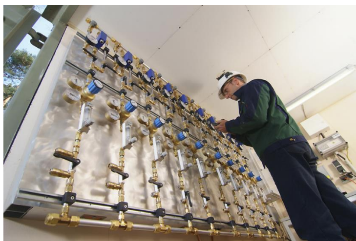
Figure 2. Control site for monitoring the oxygen injection.

A critical aspect of the technology is the oxygen injection. Oxygen gas is pressure-pulsed into the aquifer to induce a finely dispersed, high-surface, residual trapped oxygen gas phase in the bubble wall zone, which supplies sufficient oxygen to the passing groundwater flow for stimulation and control of microbial oxidative degradation of ammonium [1] [2] . Groundwater modelling and pilot scale experimental work on the fundamentals of gas sparging were conducted to test and optimize the system [3] [4] [5] . Effective mixing of oxygenized water with anaerobic water was achieved using heterogeneous gas distribution in the wall and downstream without exceeding a critical dissolved oxygen concentration for nitrification in the bulk flow. The control site for monitoring the oxygen injection is shown in Figure 2.